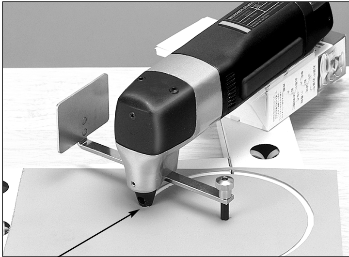
Material feeds into slot in nozzle.