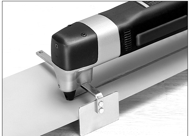
Straight Line Cutting