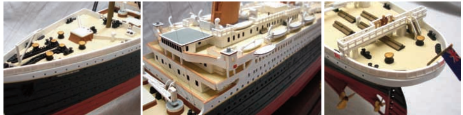
#85205 Minicraft Models R.M.S. Titanic Centennial Edition 1/350 Scale Model Kit... List $79.99... Our Price $56.45

Minicraft Models marks this anniversary with the release of the new RMS Centennial Titanic. This kit contains over 400 separate parts molded in what is recognized as the most popular scale for plastic model ships. The kit features a one piece hull, engraved deck and hull detail, decals, fine rigging line and commemorative "Centennial" plaque. When completed, the model measures almost 30" long, which makes it the largest, most accurate plastic model of the Titanic available anywhere.