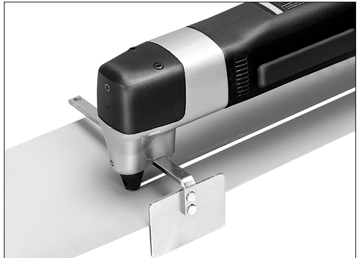
Straight Line Cutting