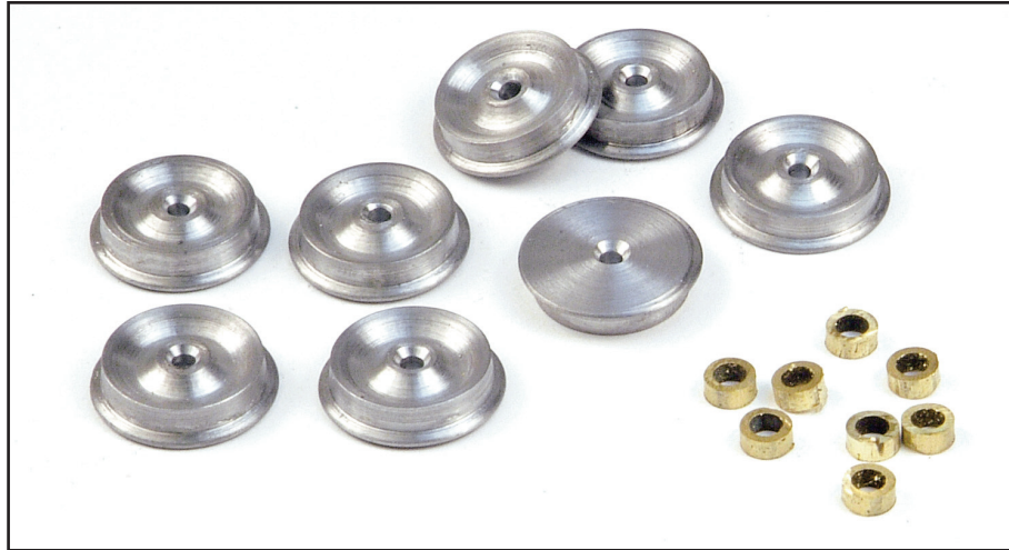
Scale wheels with axle bushings to reduce side-play in the trucks.

Micro-Mark has made arrangements with Current Line Models to produce scale wheels that are a direct replacement for the hi-rail wheels that come with the Williams O gauge Peter Witt streetcar.